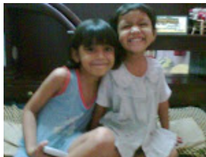
my cute daughters